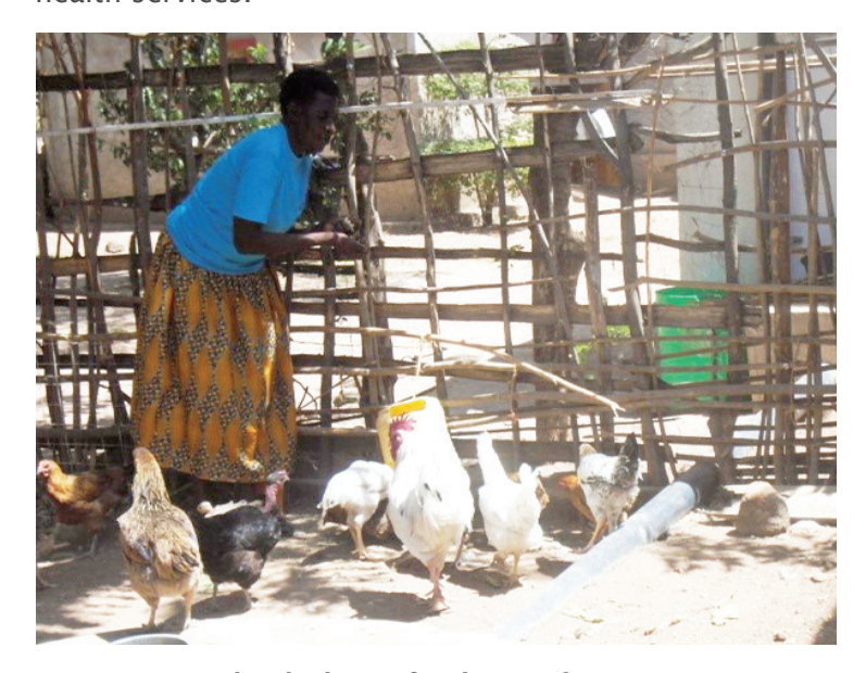
A group member looking after her poultry

Also in the category of vulnerable groups are orphans and vulnerable children. WN has taken steps in helping these orphans by educating the community and the orphans themselves together with their caregivers on the prevention of HIV infections and caring for the affected. The orphans and their caregivers have been supported to initiate income generating activities, often focusing on rearing small animals such as goats, rabbits and poultry. Raising of goats and poultry are the most popular activities because the orphans consume the milk and eggs as part of the nutrition boosting strategy in addition to getting income through the sale of offspring, milk and eggs. The money generated is used for household upkeep, school fees and paying for health services.