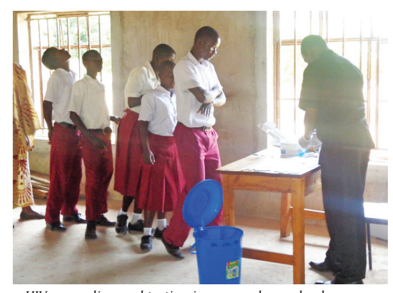
HIV counseling and testing in a secondary school

An expectant mother who is infected can also transmit the virus to her unborn or born child. Hence the strategy known as the 'prevention-of-mother to child transmission' has been devised to reduce the transmission during pregnancy, labor, delivery and post-delivery through breastfeeding. Sensitization and awareness campaigns are mounted among women to attend ante- and post-natal clinics in order to detect if the mother is HIV positive and then efforts are made to teach her how to avoid infecting the baby, including putting her on anti-retro viral therapy.